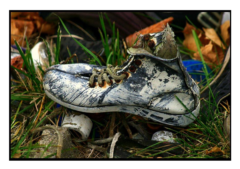
Fig. 4. Image of a shoe. Mary Stebbins Taitt detroitd.blogspot.com/2009/11/art-heidelberg February 10, 2010