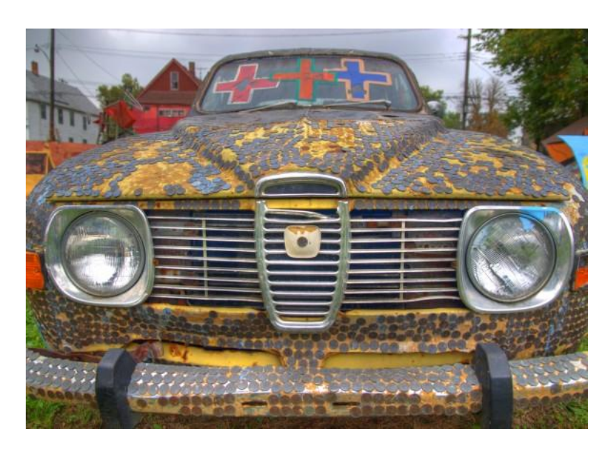
Fig. 5. Image of a car. Cult Case: Culture & Art Online Magazine, 4/1/08-5/1/08. www.cultcase.com/2008_4_1_archive.html February 10, 2010