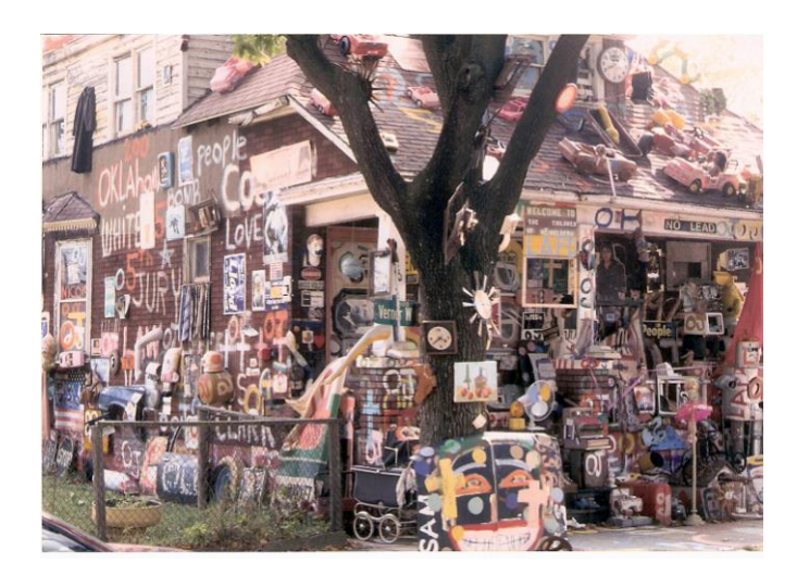
Fig. 1 Photograph. Photographer and date unknown.