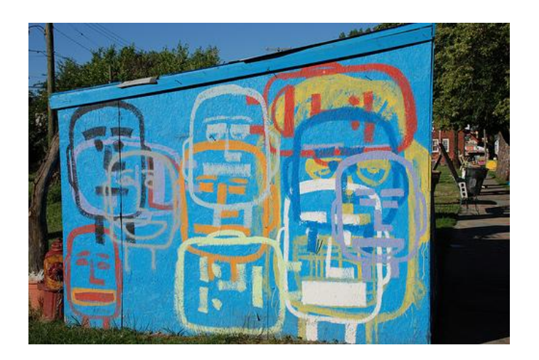
Fig. 3 Faces. gehadhaddi.com/files/gimgs/