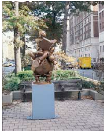
Educating the Rich on Globe , 1997. Bronze, 62.5 x 35 x 37 in. View of work installed on 114th Street, New York.

This quality of resistance, however, can also be read as a deconstructive moment, the site of a play of meanings that can be read both positively and negatively. What from one perspective is understood as resistance (i.e., the refusal to submit to authority) may from another be seen as catharsis, the dramatic release that gives vent to pent-up frustrations, the channeling of discontent into socially acceptable mechanisms such as works of art. And artworks, contentious though they may be, are still things to be possessed, part of a system of rarefied commodities whose very existence is made possible by the forces under critique. Thus, as with Dostoyevsky’s main character in Notes from Underground , the reliability of Otterness’s narrative becomes an issue to be resolved. And along with this questioning comes a consideration of public art in these postmodern times.