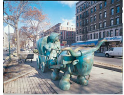
Large Covered Wagon , 2004. Bronze, 85 x 185 x 48 in. View of work installed on 147th Street, New York.

The accessibility of Otterness's comic-book illustrational style acknowledges what Dave Beech and John Roberts term the "specter of the aesthetic" (i.e., the philistine, who is uninformed not necessarily so much by personal choice as by social circumstance) that permeates the ether surrounding the public sphere; but Otterness's work doesn't condescend like so much Postmodernist appropriation of popular culture seems to do. The work's complex, often subversive content also lends itself to more reflective appreciation. In this way, Otterness integrates the realms of popular culture and fine art, which in reality have always been united by their alienated condition under capitalist rule. Their mutual alienation is made all the more apparent by the work's insertion into the public domain. For although art is autonomous, something created in, of, and for itself, its independence is bound by social determination. Freedom from any purpose other than its own existence (the privileged position atop capital's soft belly) comes at a price: art can speak the truth but can't do anything about it. And with public art, this short-circuiting of redemption is put on display for all to see, philistine and aesthete alike.