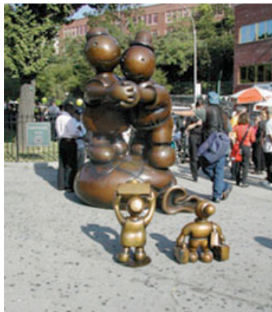
Free Money , 1999. Bronze, 36.25 x 27 x 20.75 in. View of work installed on 107th Street, New York.

This is especially evident in works in which images of capitalist and proletarian are dialectically intertwined. In Educating the Rich on Globe (1997), a circle of worker-figures forms the pedestal supporting the earth, like Atlas in Greek mythology. A top-hatted plutocrat in evening clothes lies on his back on top of the world, coins falling from his pockets. Astride his belly sits a woman reading a book. The sculpture visually presents Karl Marx's base/superstructure analysis, with labor power constituting the foundation on which the capitalist world rests; in turn, culture depends on capital (what Clement Greenberg in "Avant-Garde and Kitsch" calls "the umbilical cord of gold") to provide respite from the need for toil in order to be free to pursue "higher" endeavors like literature and fine art. In Marriage of Real Estate and Money (1996), a daisy-topped house dressed in a skirt stands next to a penny, which holds a bowler in the crook of its arm. It's a portrait of a happy couple, aristocracy and bourgeoisie in blissful dominion over land rents and wage labor, the mechanisms for wresting control of the means of production from the proletariat and the foundations of alienation under capitalism.