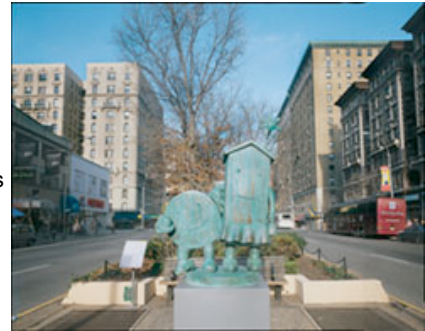
Marriage of Real Estate and Money , 1996. Bronze, 74 x 53 x 32 in. View of work installed on 91st Street, New York.

Otterness's aesthetic is best seen as a riff on capitalist realism. On the one hand, it relates to the recognition by Gerhard Richter, Sigmar Polke, and Konrad Lueg (who took up the term for an exhibition of paintings in 1963) of the realities of the art market in which supposedly autonomous objects of disinterested contemplation circulate as highly desirable commodities to be bought and sold. But it's also about what has come to be more popularly understood by the term "capitalist realism," the representations of advertising and the media, following Michael Schudson's influential 1984 study, Advertising, the Uneasy Persuasion . Otterness's work is a contemporary form of social (as opposed to socialist) realism, an art of post-Cold War disenchantment, an expression of anxiety in the face of global capital unbound.