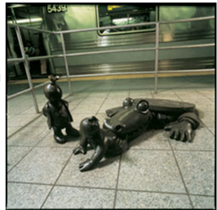
Life Underground , 2002. Bronze, multi-part work commissioned by MTA, New York City.

One Sunday in late November near dusk, a family walks down Broadway toward Lincoln Center on Manhattan's Upper West Side. As they approach 65th Street, the mother, a casually but stylishly dressed woman, says, "There's a sculpture over here I don't quite understand, but I think it's hysterically funny." She leads the group to an L-shaped assembly of bronzes in a broad plaza that divides the uptown, downtown, and cross-town lanes of rushing traffic and also contains entrances to the 1 and 9 subway lines. They gather around the sculpture's various elements: a six-foot-long squat rectangular pedestal on which sit a mouse, two dogs, and a bird; a shorter two-tiered pedestal set perpendicular to the first, supporting an owl on a perch on the upper level and a cat sitting on its haunches on the lower; and a hound standing on its hind legs on the ground, facing the cat. Dressed in a business suit, the hound holds one paw behind its back and a sheaf of papers in the other. The entire vignette is rendered in comic-book fashion.